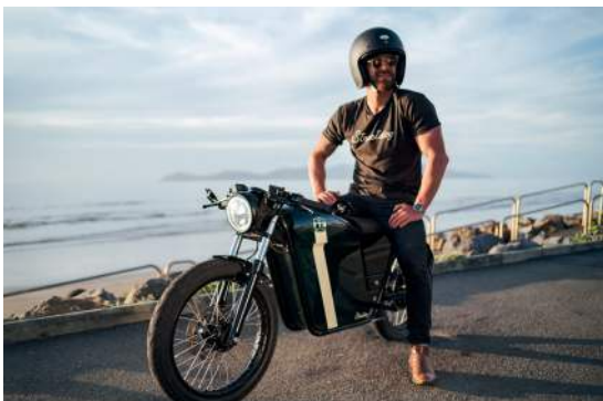
Figure 11: 2021 FTN Motion Streetdog