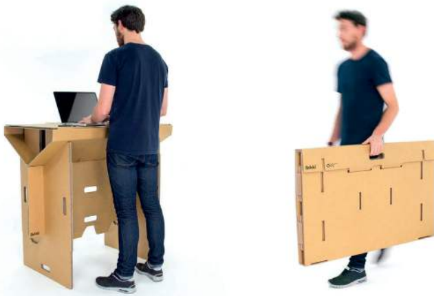
Figure 15: Refold standing desk in use and in transport