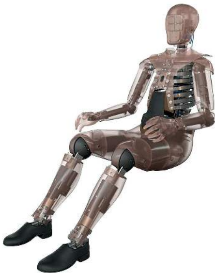
Figure 4: A crash test dummy is an example of an instrumented physical model