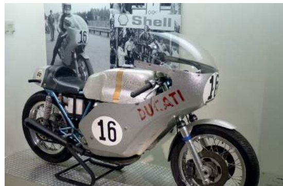
Figure 12: 1972 Ducati Desmo Racer