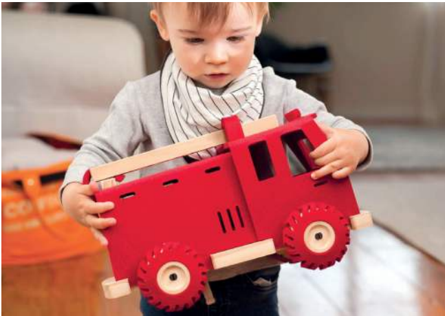
Figure 9: Brave Dave™