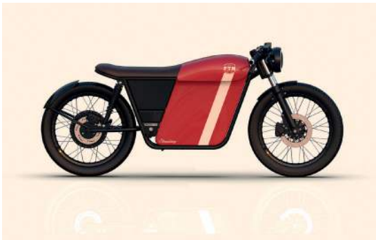
Figure 13: FTN Motion Streetdog CAD rendering